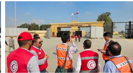
Japan and Egyptian Red Crescent team in front of Rafah check point.