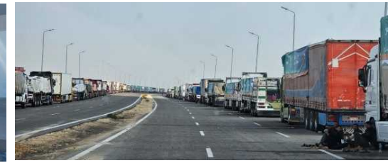
Egyptian Red Crescent warehouse in Al-Arish, where Japanese support items are checked and rearranged. Long queue of trucks carrying supports to people of Gaza in front of Rafah check point.