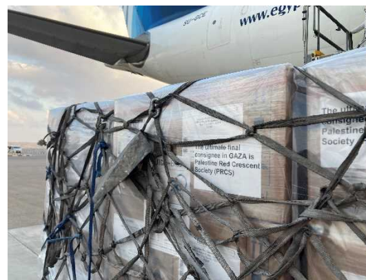
Japanese support of medical items unloaded at Al-Arish airport.

Along with the above aforementioned USD 10 million Emergency Grant Aid, the Government of Japan has decided to provide additional aid amounting to approximately USD 65 million to improve the humanitarian situation.