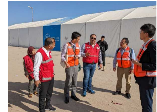
Japan tries to provide food, water, medical items and other humanitarian assistance to people in Gaza in a most speedy and efficient manner.